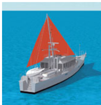
MARATHONER: Everything about the Dashew 83 aids in her ability to go long distances with maximum seaworthiness, including a fallback emergency sail raised off the boom.