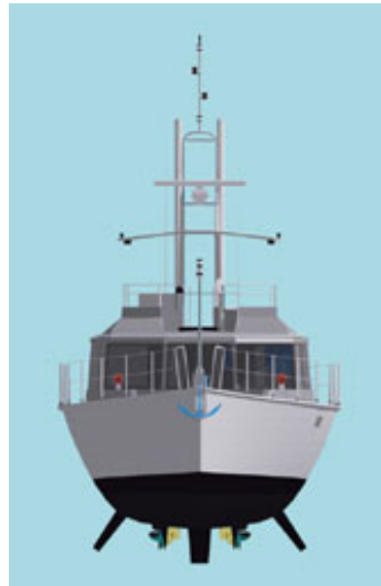
LONG & LEAN: Like a carving knife, the 83 is meant to slice the waves—without roll, thanks to her narrow and very slippery hull.

The official design brief for the Dashew 83 Offshore Motor Vessel sets some ambitious and even provocative goals: to be "as comfortable as our sailing designs for long ocean voyages" and "capable of making passages of 4,000 to 6,000 miles at an average speed of 12 knots;" to have the "ability to make fast passages to windward in reasonable comfort" and "to cope with heavy weather at least as well as the sailing yachts but at a reduction in the work required by the crew;" to be able to "prepare for long-term storage in half a day" and be removed "from storage within a similar time frame;" to meet the goal of "minimal maintenance, maximal reliability;" and to suit "operation by a crew of one or two."